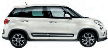
268 Pastel Gelato White