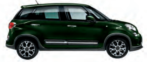
390 Metallic Toscana Green