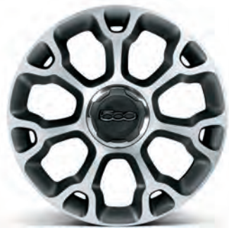
5EQ 17" 225/45 R17 ALLOY WHEELS DIAMOND ECOREFLEX GLOSSY BRUNEX