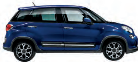
530 Metallic Venezia Blue