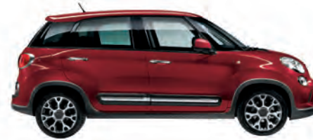
108 Metallic Amore Red