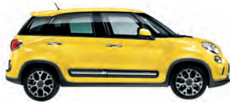
830 Pastel Sorrento Yellow