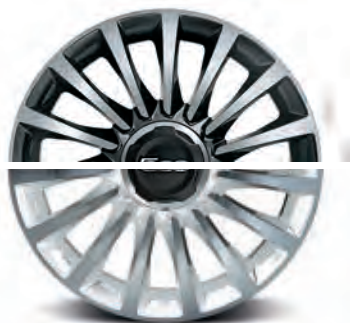
LINEACCESSORI 17" 225/45 R17 ALLOY WHEELS DIAMOND WHITE