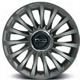
LINEACCESSORI 17" 225/45 R17 ECOREFLEX GREY ALLOY WHEELS