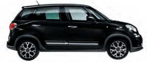
601 Pastel Cinema Black