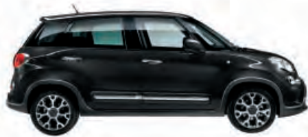
609 Metallic Moda Grey